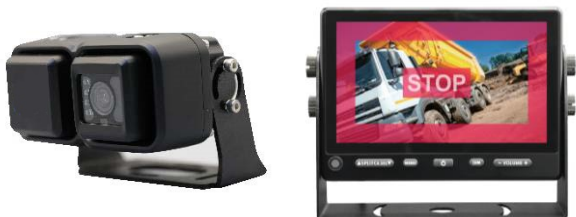
Option: Radar monitor